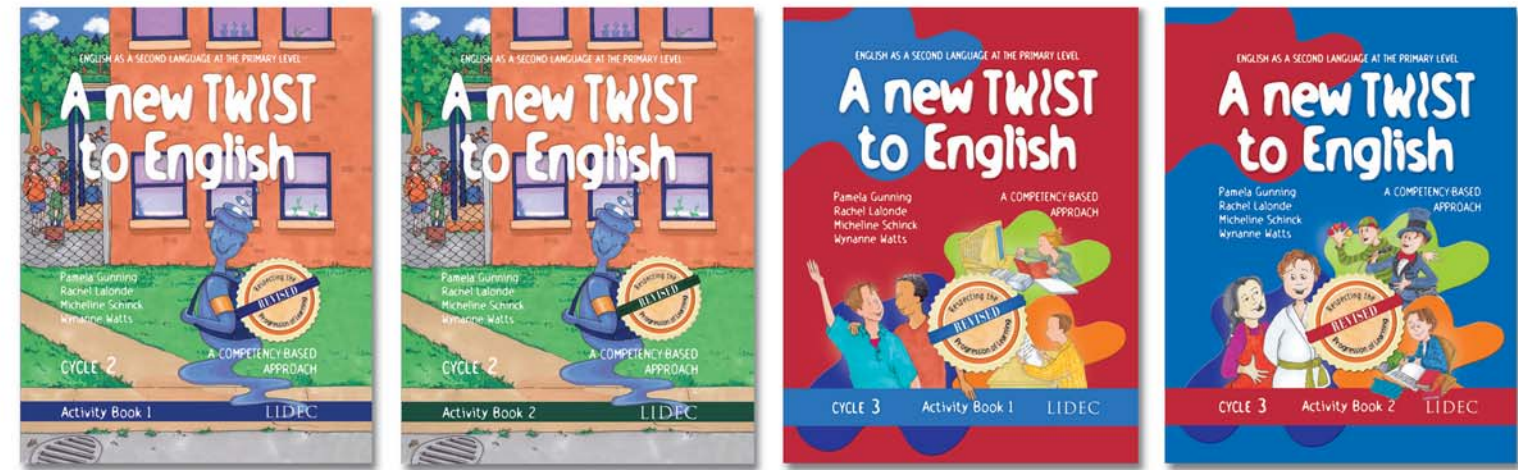
Activity Book 1 Activity Book 2 Activity Book 1 Activity Book 2